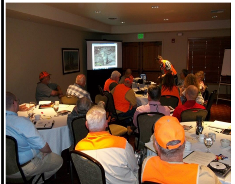
Conference Workshop on Using Technology in the Classroom

We need to recognize and honor our Junior Instructors. They are the ones who are going to carry on the teachings of gun safety not only while hunting, but in the outdoors in general. Without them coming up in the ranks to replace those of us that are — let me say no longer juniors — hunter education will fade away with the possible exception of the online courses. All junior instructors at conference were presented with a junior hunter education instructor cap from OHEIA.